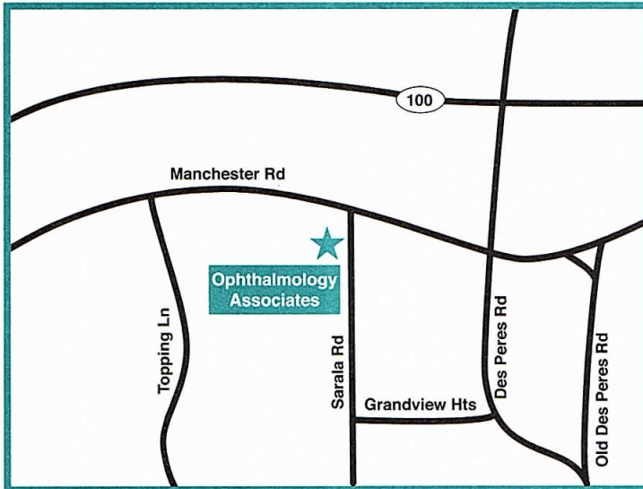
Ophthalmology Associates 12990 Manchester Road, Suite 200 St Louis, MO 63131